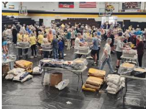
Hixson School Air Force JROTC cadets